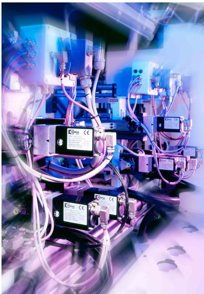
Fig. 3: Modern positioning systems on a wood processing machine

The actual power consumption for example is a very revealing parameter. If this matches the current operating conditions at any time, everything is OK. But if it increases even though the sequence of functions does not suggest this, the halstrup-walcher positioning system reports to the higherlevel controller.