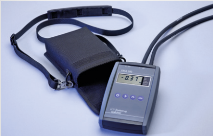
Shoulder bag EMA 200 Order no. 9074.0001