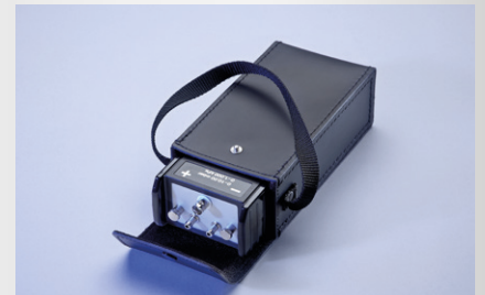
Carrying bag EMA 84 Order no. 9063.0001 (without LCD viewing window) Order no. 9064.0001 (with LCD viewing window)

Silicone tubing ID 5 mm, AD 9 mm, red (please state length required) Silicone tubing ID 5 mm, AD 9 mm, blue (please state length required) Norpren tubing ID 4,8 mm, AD 8 mm, black (please state length required) Y-piece for tubing, NW 5mm Telescoping pitot tube for flow measurements (EMA 200)