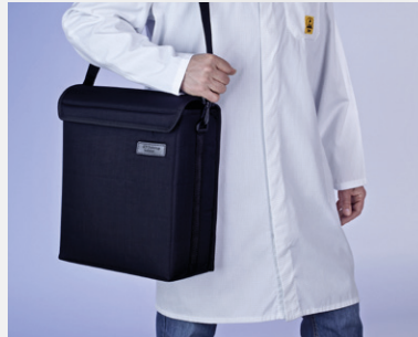
Carrying bag KAL 100/200 supplied as standard