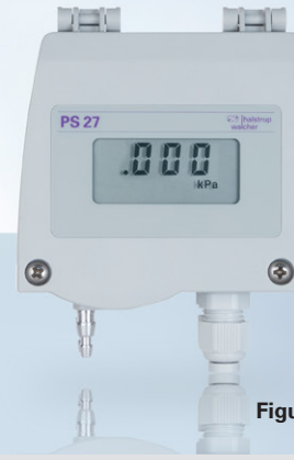
Figure: Version with display